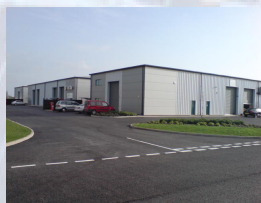
SS = Manufacturing Plant